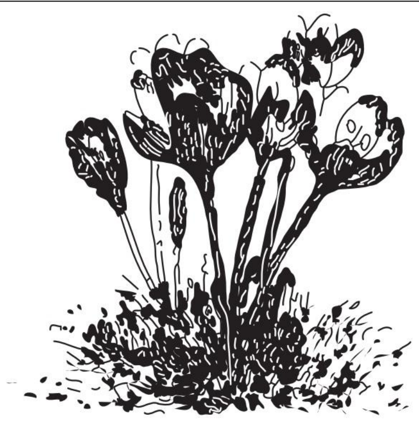
Twig of Colchicum autumnale